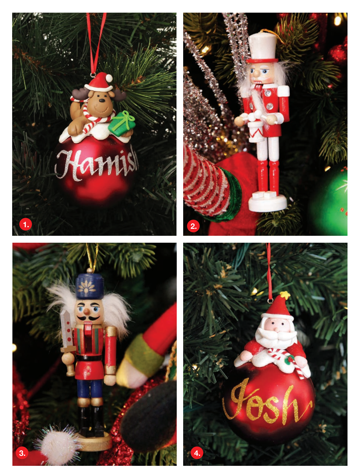
1. RED REINDEER CHRISTMAS CHARACTER BAUBLE, 2. RED AND WHITE NUTCRACKER TREE DECORATION, 3. NUTCRACKER TREE DECORATION WITH GOLD BASE, 4. PERSONALISED SANTA CHRISTMAS CHARACTER BAUBLE