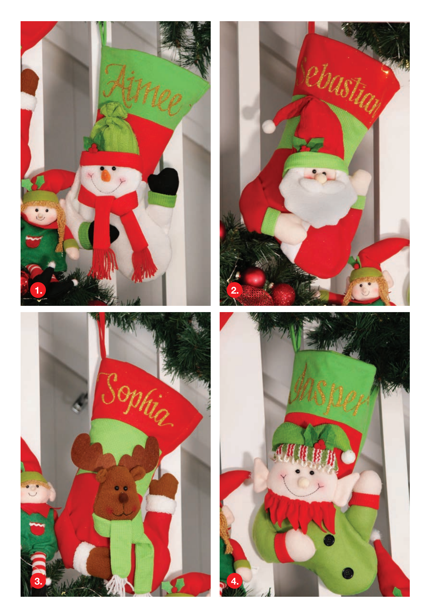
1. PERSONALISED 3D SNOWMAN STOCKING, 2. PERSONALISED 3D SANTA STOCKING, 3. PERSONALISED 3D REINDEER STOCKING, 4. PERSONALISED 3D ELF STOCKING