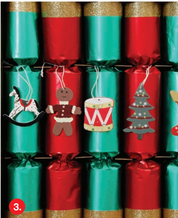
1. NORDIC GLASS DOME DECORATIONS, 2. GREEN AND RED WIRE CHRISTMAS TREES WITH SNOW, 3. RED AND GREEN TOY BOX CHRISTMAS BON BONS