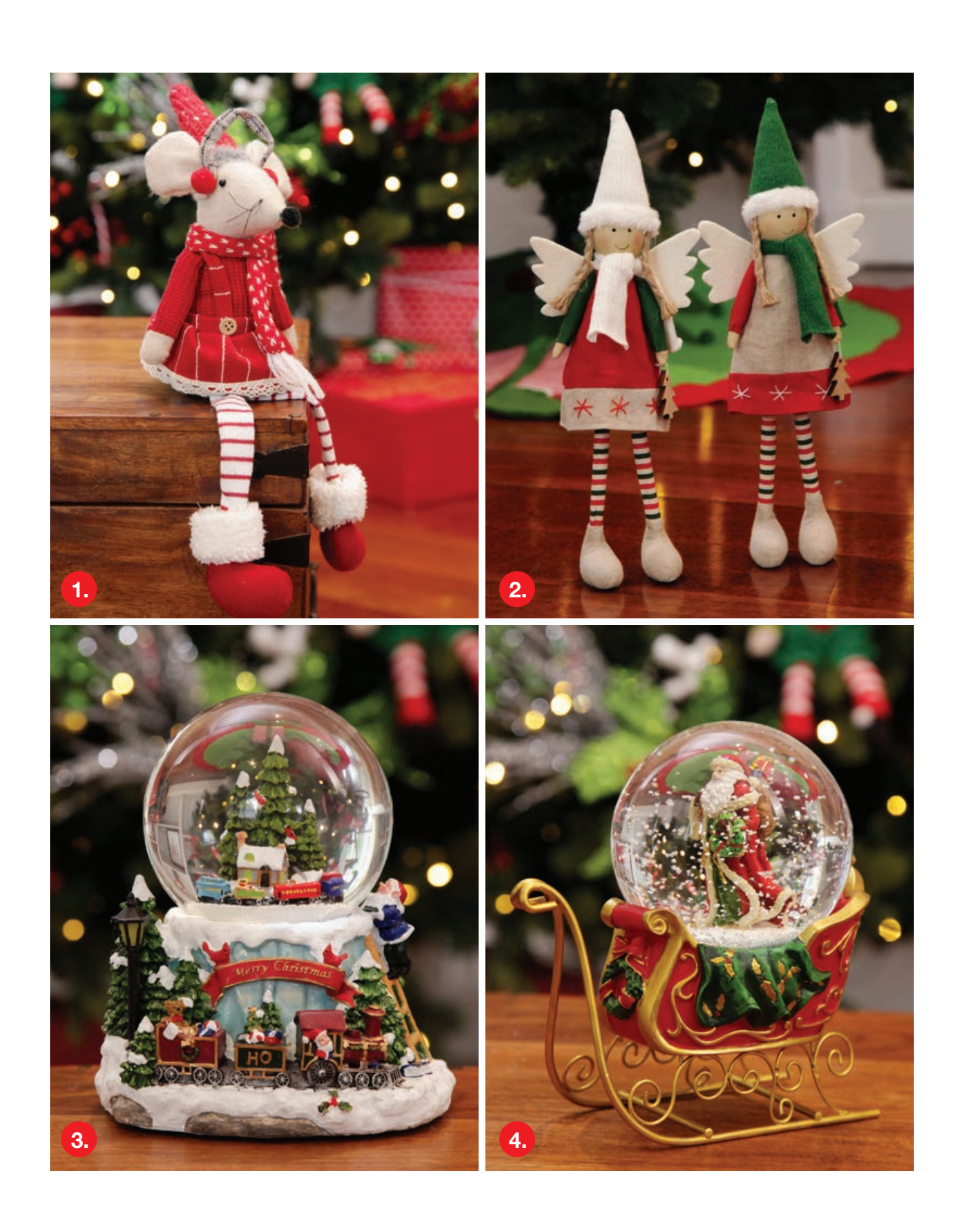
1. FABRIC GIRL MOUSE WITH DANGLING FEET, 2. FABRIC STANDING ANGEL WHITE AND GREEN, 3. CHRISTMAS TRAIN SNOWGLOBE ORNAMENT, 4. SANTA SLEIGH SNOW GLOBE