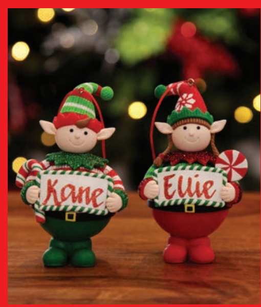
PERSONALISED CHRISTMAS EVE BOX (LEFT) & PERSONALISED ELF CHRISTMAS CHARACTER ORNAMENT HOLDING PLAQUE (ABOVE)

MANY OF THE CHRISTMAS BAUBLES, STOCKINGS AND DECORATIONS IN OUR RANGE HAVE BEEN CAREFULLY DESIGNED AND SELECTED TO ALLOW FOR A NAME OR MESSAGE TO BE ADDED IN BEAUTIFUL GLITTER CALLIGRAPHY. EACH ONE IS INDIVIDUALLY HAND DONE BY OUR TALENTED ARTISTS, MAKING IT A UNIQUE KEEPSAKE THAT WILL BE TREASURED FOR MANY YEARS TO COME.