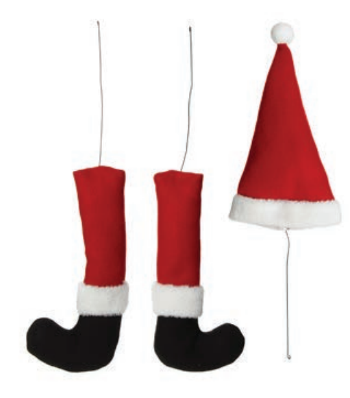
SANTA HAT & LEGS PICK SET