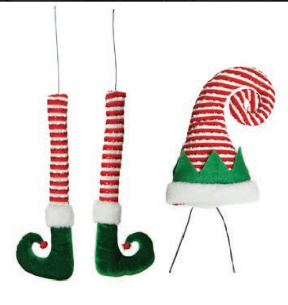
STRIPED ELF HAT & LEGS PICK SET